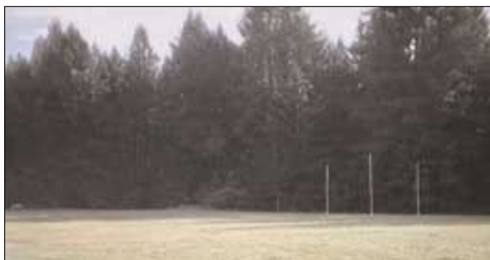
Parade Ground at Elk River Scout Camp

Orca Lodge successfully conducted both Spring Ordeals on the weekends of June 1-3 and June 15-17. The Mow-A-Toc Chapter hosted the Elk River ordeal, where 10 new candidates were inducted into the lodge. Two weeks later, Cabrosha Chapter held their ordeal, inducting 41 new members. Once again, the Brotherhood Hike was well