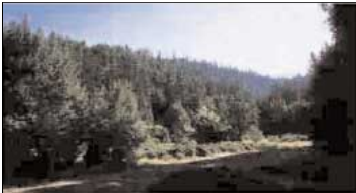
North fork of the Navarro at Camp Masonite Navarro