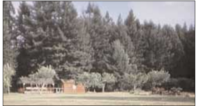
Elk River Shower House