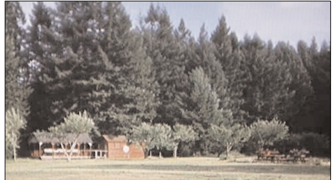
Elk River Shower House

his valuable expertise. Secondly, both the Brotherhood and Ordeal ceremony teams are in need of members. At this point the teams are in a rebuild