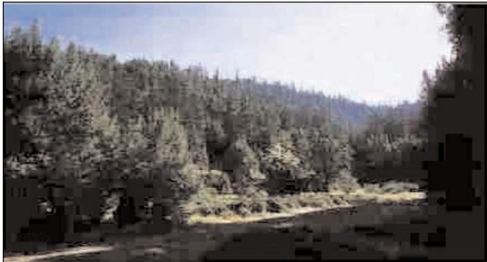
North fork of the Navarro at Camp Masonite Navarro

ing arrowmen who wish to participate in the ceremonies to help create that unforgettable mystique of a ceremony truly car-