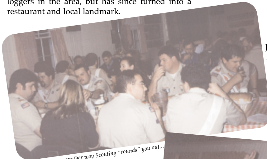
Lodge members show another way Scouting "rounds" you out...

The dinner was preceded by a Lodge Executive Board Meeting, held at the Eureka Scout Office. Executive Meetings are held four times annually, and are open to all arrowmen wishing to attend. The next meeting is on April 5th, at 1:00, at the Santa Rosa Scout Office.