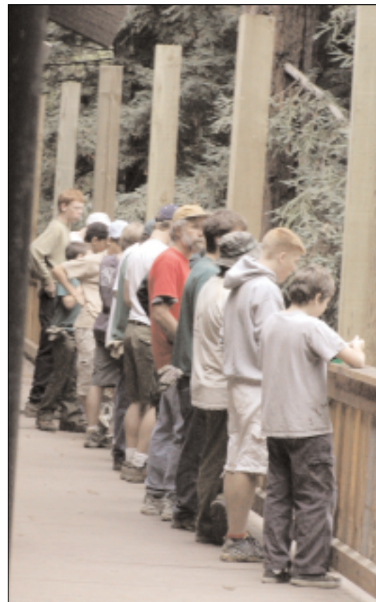
Candidates at Navarro lining up for the project...

Congratulations to all Ordeal Honor members: