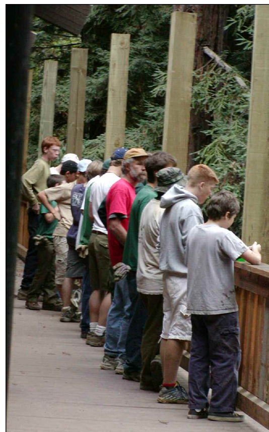
Candidates at Navarro lining up for the project...

Congratulations are extended on behalf of the Lodge Executive Board to all new members, and to all who sealed their membership in the order