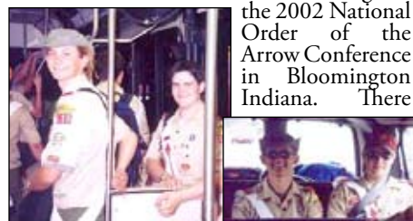
the 2002 National Order of the Arrow Conference in Bloomington Indiana. There