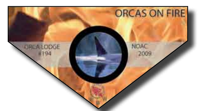
"Orcas on Fire #2"