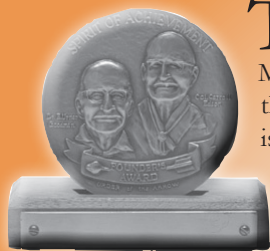
The Founders Award

The 15th annual Lodge Dinner is fast approaching. It will be hosted by Mow-a-Toc Chapter on November 22 at the Scotia Fire Station in Scotia. The cost is just $35 for Arrowmen (this includes both dinner and dues for 2009.) For non-members, the cost is a reasonable $20, for youth under 10 just $9, and children 4 and under are Free. This event is open to families as well as