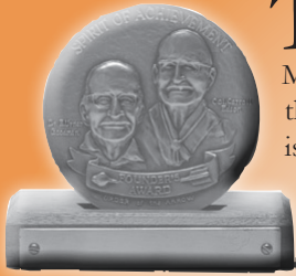
The Founders Award

The 15th annual Lodge Dinner is fast approaching. It will be hosted by Mow-a-Toc Chapter on November 22 at the Scotia Fire Station in Scotia. The cost is just $35 for Arrowmen (this includes both dinner and dues for 2009.) For non-members, the cost is a reasonable $20, for youth under 10 just $9, and children 4 and under are Free. This event is open to families as well as