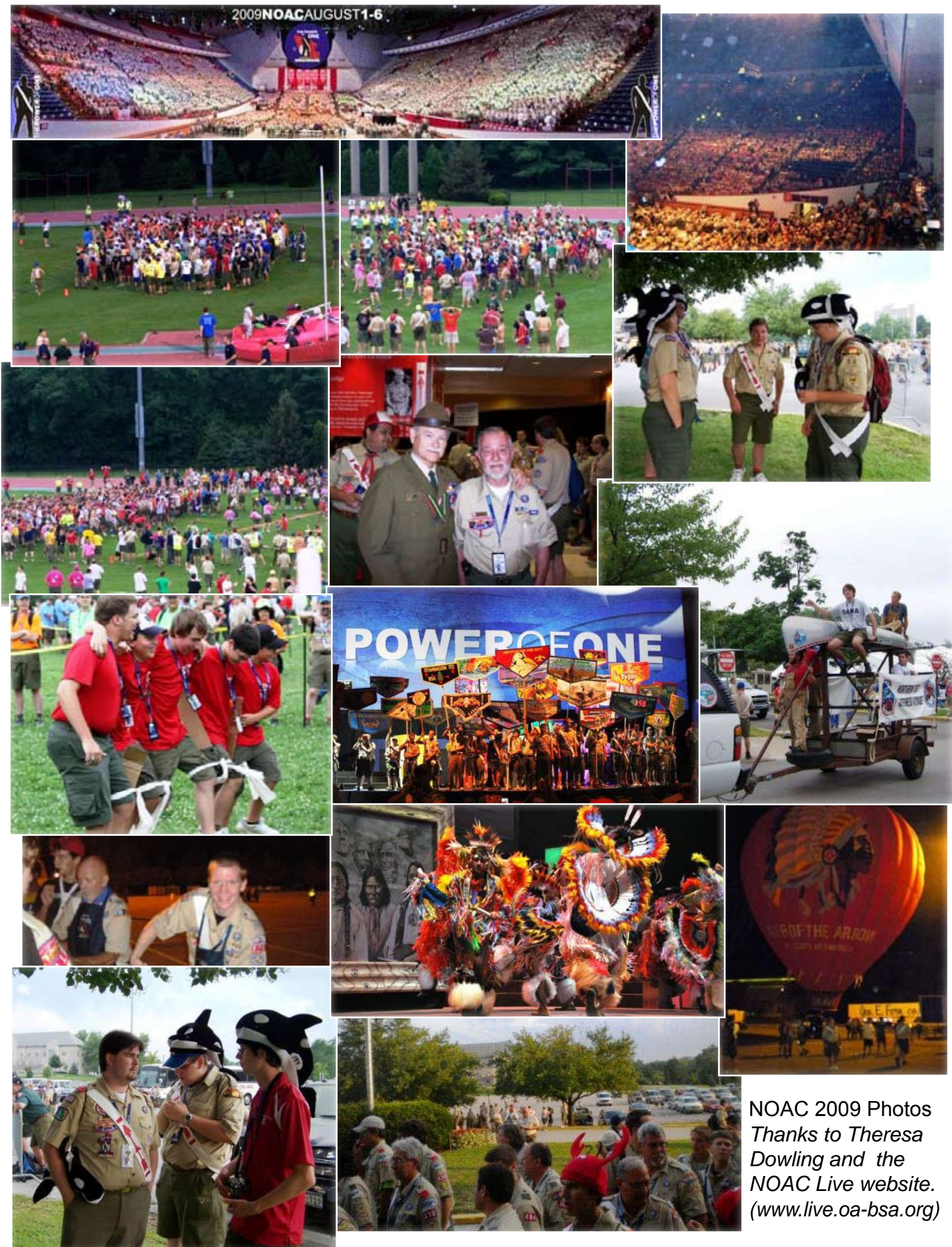
NOAC 2009