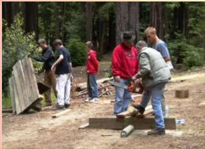
Hard at work at a Spring Ordeal

It's that time of year again. Orca Lodge is once again holding two Fall Ordeals this year. Cabrosha Chapter will be hosting their Ordeal at Camp Masonite Navarro on the weekend of October 16-18. Three weeks later, on the weekend of November 6-8, Mow-A-Toc Chapter will be holding their Ordeal at Elk River Scout Camp. These Ordeals should be similar to ones held in the past. There are many service projects to complete at both camps, as well as a variety of other jobs. A Brotherhood Review session will be offered at each Ordeal, for those who wish to seal their membership in the order. Be sure that you attend one of the weekends, and participate in the fun, service and fellowship. Return the enclosed registration form to the Eureka Council Office no later than Friday,