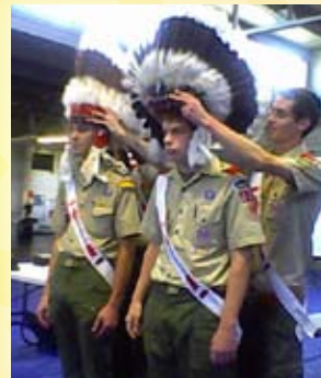
The changing of the officers