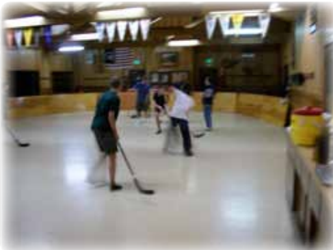
New Ordeal members celebrated by playing a rousing camp of sock hockey in the dining hall.