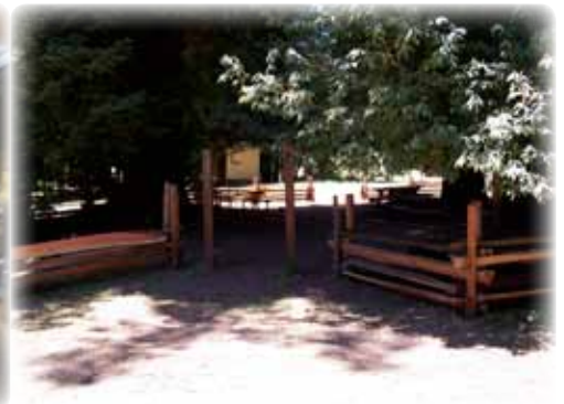
Efforts to rebuild the redwood grove fence were finally completed.