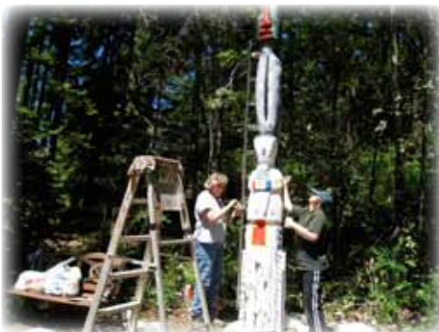
Terri Forrest and Dawn Brown spent the day repainting the camp's totem pole.