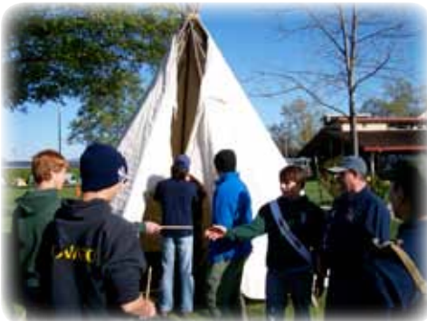
How many Arrowmen does it take to set up a teepee?