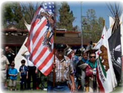
Dancers from both sections participated in a large pow-wow Saturday afternoon.