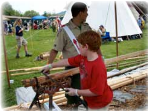
Arrowmen were able to teach participants how to make lodge poles for teepees.