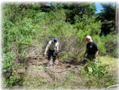
A lot of brush was cleared off of the log deck paving the way for conclave parking.