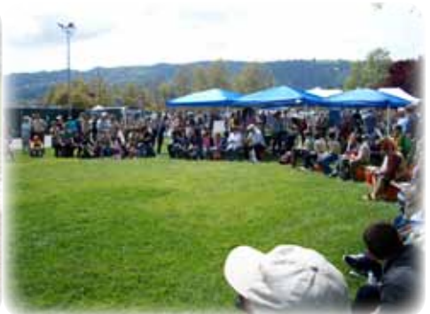
Over the course of the weekend, thousands of Scouts were able to enjoy the events of the OA Indian Village.