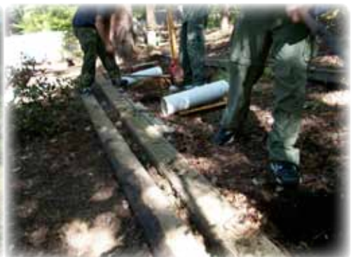
Two rows of new benches were added to the fire bowl to provide more viewing for conclave's shows.