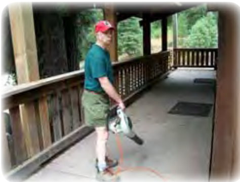
There was a lot of prep work needed for Conclave, including sweeping off the deck with a leaf blower!

If you have never before attended a conclave, you missed out this year, but you should definitely attend conclave next year. Each conclave offers a new and exciting experience for every participant. Each year brings with it a new Council of Chiefs and thus a new driving force forming conclave into a different body each year. No two conclaves are the same, but every Section W3N Conclave is definitely awesome. It is because of this that each and every Arrowman in Orca Lodge should attend conclave each year. Conclave offers us an opportunity to grow as Arrowmen and a way to serve our fellow Scouts when it is our turn to host—Orca will be hosting the 2015 Conclave, which will come sooner than one would expect.