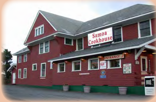
The wonderful Samoa Cook House!

The cost is $40, which includes the cost of dues for 2011.