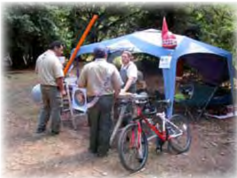
The High Adventure Booth promoted Trail Crew, Wilderness Voyage, SummitCorps, and other high adventure opportunities we have as Arrowmen.