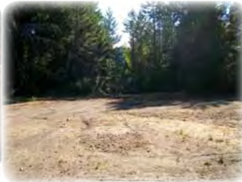
The end result of our log deck clearing. It looks better than it has since the last time a conclave was at Navarro - over 20 years ago.