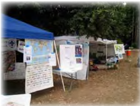
The Midway at Conclave included booths from each Lodge, buffalo hide scraping, rock climbing, high adventure, and Leave No Trace.

The culmination of the weekend was Saturday night's