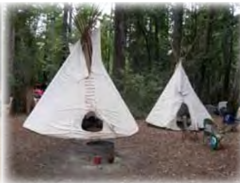
The hill was completely runover by camping Arrowmen, including some Arrowmen who slept in tipis.