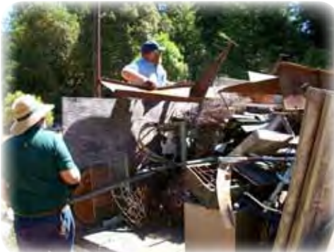
We were able to haul away tons of scrap metal from the logging deck to clear it for use as a parking lot for conclave.