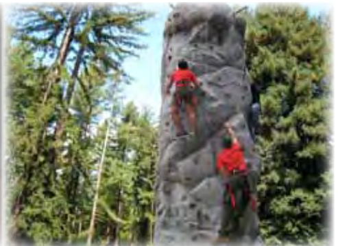
Conclave participants had the opportunity to use Redwood Empire Council's climbing wall, and featured a race between the National Vice Chief and the Western Region Chief.