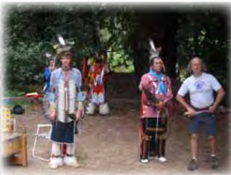
Conclave would not be complete without an American Indian Affairs program, including two classes on dance, drum, and ceremonies.