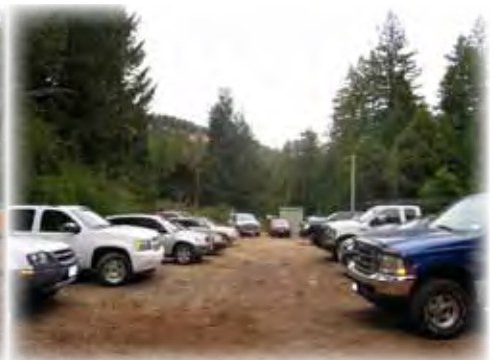
The fruits of our efforts clearing the logging deck resulted in a large parking lot, doubling the amount of parking in camp.