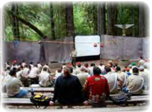
Training at this year's conclave featured a summation class taught by Ben LeRoy on why the OA as a whole needs us individuals.