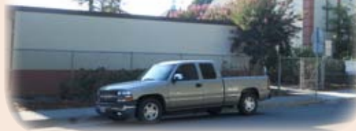
St. Johns Catholic Church & School, Healdsburg

The Lodge Dinner will be preceded by a Lodge Executive Board Meeting at 2:00 at the St. John's Catholic Church School. The dinner will follow and begin with a social hour at 5:00, followed with dinner being served at 6:00. The Lodge's annual awards will be presented during the dinner, including: Silver Flukes, Founder's Awards, James E. West Fellowships, 2012 Officer Elections, as well as the first public announcement of this years Vigil Candidates.