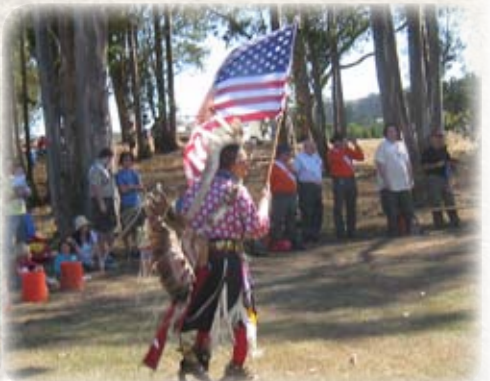
Opening of afternoon indian dancing.