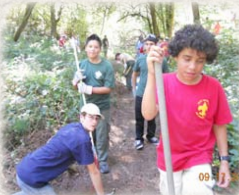
The Service Project really got down to business repairing a trail on the base.