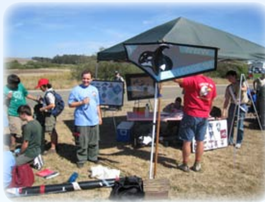
The Chief holds down the Midway Booth at the conclave.

For most, it all began with registration on Friday night. Then one moved quickly to set up their tent before darkness and grab a quick bite to eat from the on-site Trading Post. Next up was the opening show followed by a cracker barrel. One thing about the OA, there always seems to be plenty of food around. Oh yeah, there was a lot of meeting and greeting of friends, patch trading, and just plain fellowship. Some got to bed on time, most were up late just catching up on old times or getting to know new friends. In the