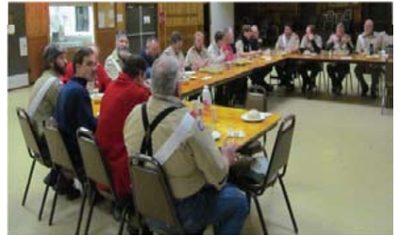
Vigil Dinner, 2012

Our 2013 Vigil dinner we hope will be a drier event with the fellowship of our lodge's newest crop of Vigil candidates. All good things come with time.